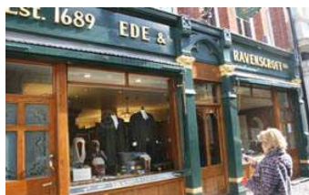
Ede & Ravenscroft (Suppliers of wigs & gowns)