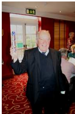
Some Lucky Raffle Prize Winners