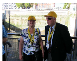
Where did you get those hats?