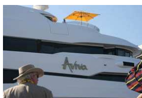
NOT the Company's Yacht!!