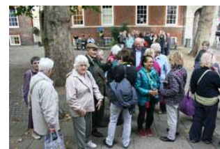
Finish of Tour at Temple

On a blustery autumn day, we gathered to explore yet another corner of London. This time we were off to see the Law Courts, Inns and Chambers of London