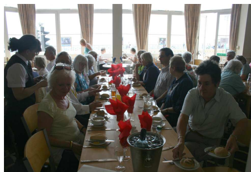
Seated ready for lunch at the Royal Albion