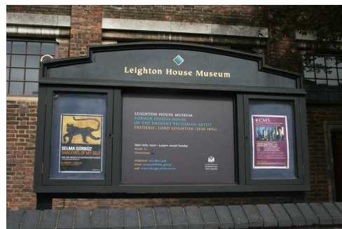
Leighton House and Sign

From a quiet tree lined road in Kensington, we stepped through the door of the Leighton House Museum & were transported to the Orient,