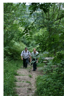
Up the Rustic Steps

This walk followed the coffee morning at Polhill Garden Centre. There were a few doubts at first as to whether there would be any takers, especially as a few of our walk stalwarts were unable to come. In the end nine of us went. The weather was ideal – not boiling hot as it has been on some previous occasions.