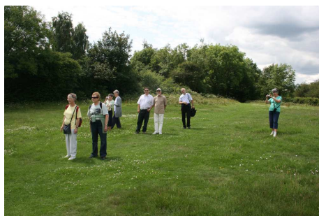
Admiring the Views