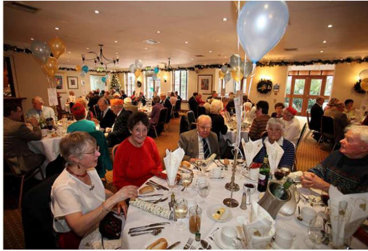
Diners ready for lunch