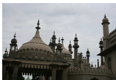
The Domes of Brighton Pavilion

'Food, women, wine, women, song, more food ...' appears to be the motto of the Prince Regent (later George IV) who preferred the social and artistic life to