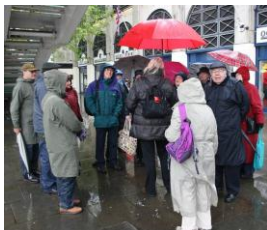
Just Walking in the Rain