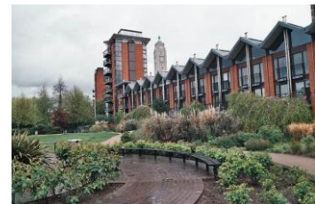
*The Social Housing – No kidding

On one of the coldest, wettest days of April, 16 brave (foolhardy?) members met at the Embankment Tube station for a fascinating walk round some of the less well known areas of the South Bank.