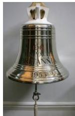
Bell from Royal Yacht 'Britannia'