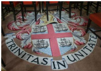
Coat of Arms woven into carpet