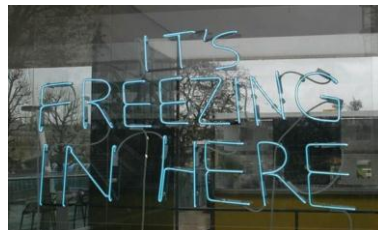
... and wet out here!