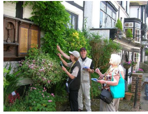
'Eureka – We've found it!' ‡