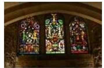
A Crypt 'Guild' Window

On a bitter March day London's Guildhall was visited. Our guides gave us the history of the building which is part of the wider story of our ever changing capital city.