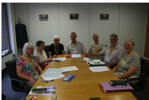
A Recent Committee Meeting