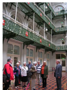
A Get-together with our other Region Committees ‡