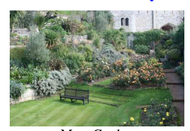
Moat Garden (Sorry No photos from inside. Photography not allowed)