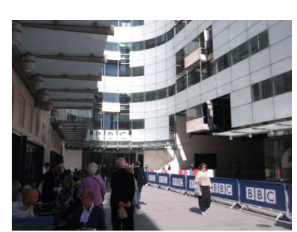
Outside Broadcasting House

In September another group toured BBC Broadcasting House. We saw the newsroom in action and the 'ONE Show' studio. I now watch knowing the orientation of the shots. Then we toured the original wing with its Art Deco features. Brian [Welch] and I had a go at reading a news bulletin and several of us enacted a radio play. I haven't