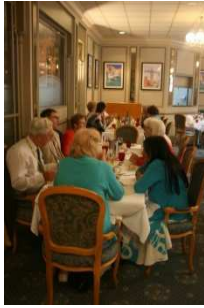
Buffet lunch, Croydon Park Hotel