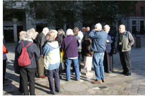
Group waiting to enter St. Paul's