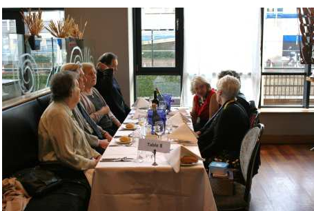
New Year Lunch 2017