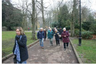
Walking through the Park