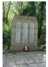
Fire Brigade Memorial

Our August visit to Highgate Cemetery was very popular. Most of us met up for coffee at the café in Waterlow Park then strolled through the park to the imposing entrance of the West Cemetery. We were split into two groups and our guide led us up a flight of steps into the oldest part of the cemetery. Highgate Cemetery was a private facility designed as an alternative to burial in an overcrowded churchyard. Even when it opened in 1839 the costs were beyond most people.