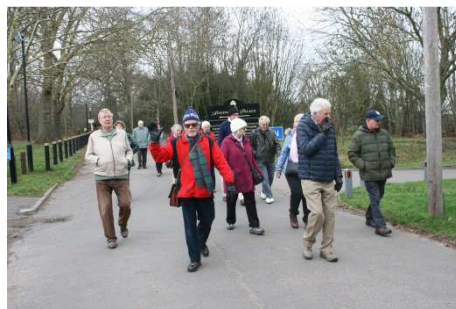
Walking through the Golf course