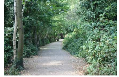
Old Railway Track

Who of our readers remember Muffin the Mule? On a rather overcast day our autumn walk started by climbing the hill from Alexandra Palace Station to the Palace itself, from where TV was first transmitted. A reminder of this fact is being put together on the site. There is a panel depicting programmes transmitted in 1953: the Coronation, Philip Harben (we also came across him in Highgate Cemetery!) and dear old Muffin.