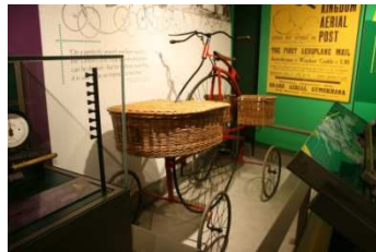
Penny Farthing Post Bike