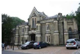
Entrance to West Cemetery