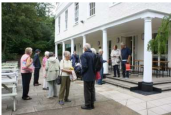
Chatting in Waterlow Park Beforehand