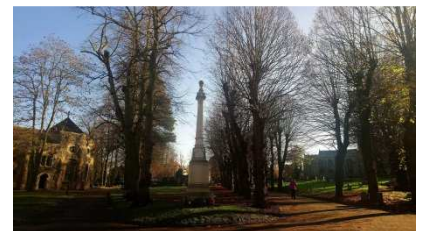
Bury St. Edmunds